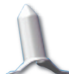
P04 anorectal transfixion tool