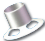
P03 anorectal dilator